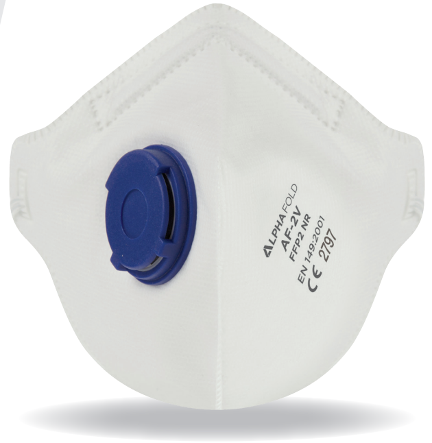
ADJUSTABLE NOSE BRIDGE